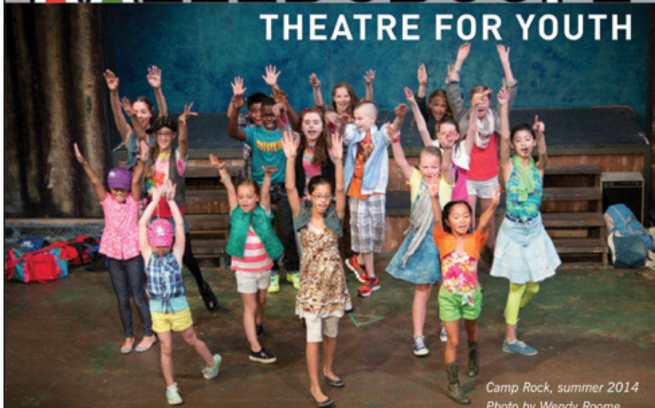
Camp Rock, summer 2014

For more information, visit our website at www.summitplayhouse.org