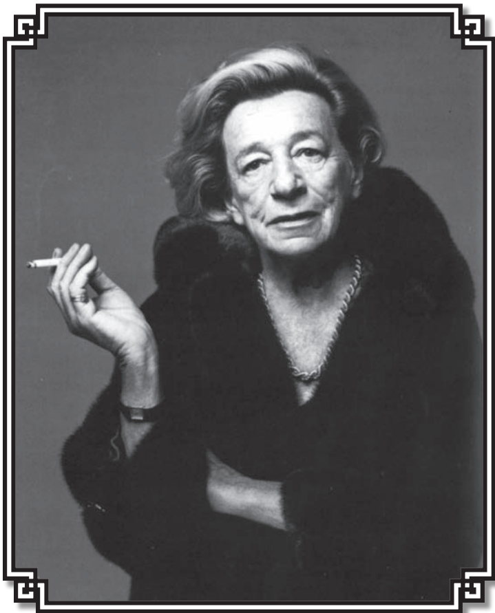
Lillian Hellman (1905–1984)